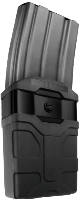
rifle or pistol magazines

You can fit various ESP rotating holders on the clip and change them according to your momentary needs.